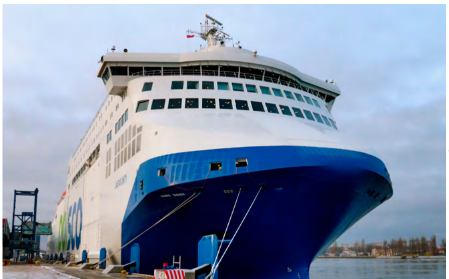
Bridge, in port of Swinoujscie

of Unity Line, the total investment is estimated to be around PLN 400 million that are approx 95 Mio Euro. A total of 3 ferries has been ordered, two for Unity Line and a third for Polferries, all of which are to be operated under the new name Polska. The Polish state supported the project with over 300 million euros, or almost fully subsidized it, to secure jobs at the shipyards and to provide the shipping company with support to compete in the international market.